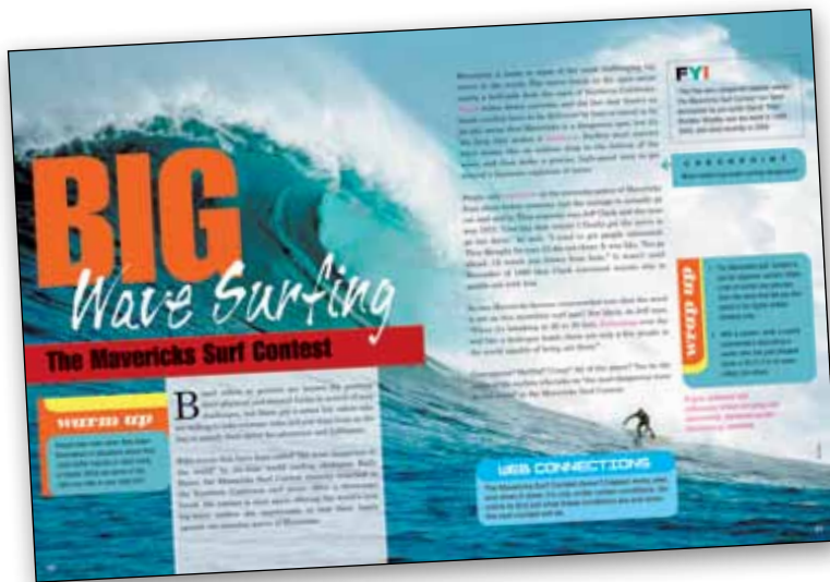
Pages from Stomp It!